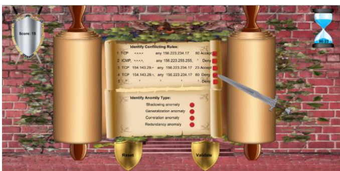
Figure 4. Snapshot of level 4.

Fourth level focuses on the detection and resolution of filtering rules conflicts.