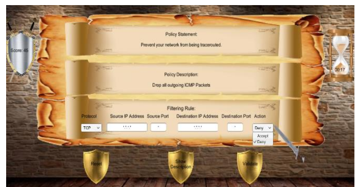
Figure 3. Snapshot of level 3.

Third level teaches student how to create firewall security policy. After successful passing the second level, the player is promoted to become an army commander. In this new mission, the player is responsible for formulating security policies in the form of declared rules for soldiers to follow up. As shown in figure 3, the player is given a security policy and he should write the filtering rule or rules to implement this policy. Table 3 represents samples of used firewall policies.