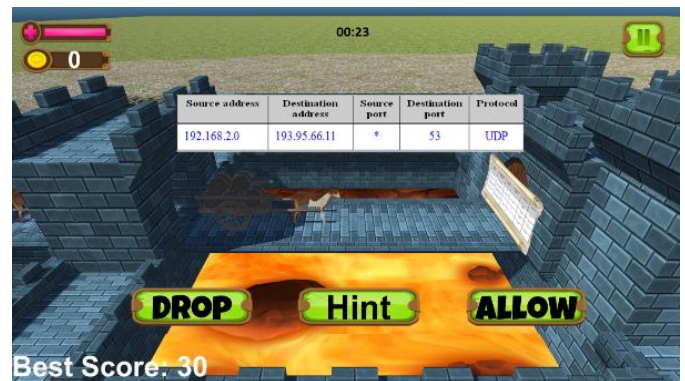
Figure 2. Snapshot of level 2.

For this regard, the player must check all carts leaving the castle to prevent any leakage of information by spies or any unwanted connection as depicted in Figure 2. The player should inspect each cart (IP packet header fields) and consult the declared (output chain) filtering rules. Then, he must decide either to allow the cart to safely go out the castle or to destroy it. Correct decision action results in scores increment and wrong decision is punished in terms of scores decrement..